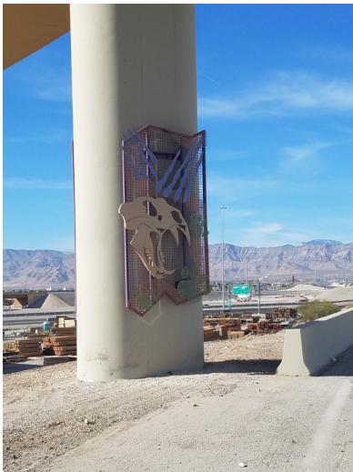
Sabertooth cat on new overpass On 215 beltway traveling west.

The bearpoppies are making a comeback! Baby ones all over the place (pic on left) will grow up to be gorgeous.