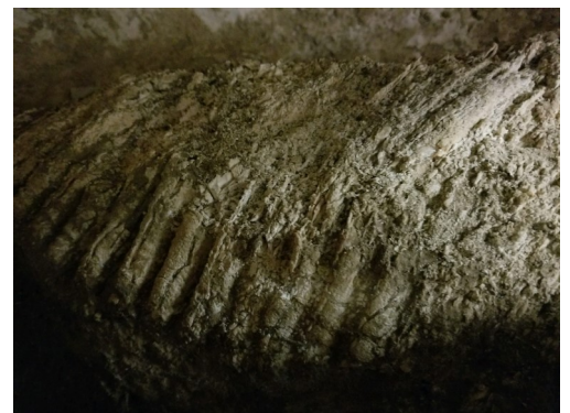
Large mammoth tooth at the repository